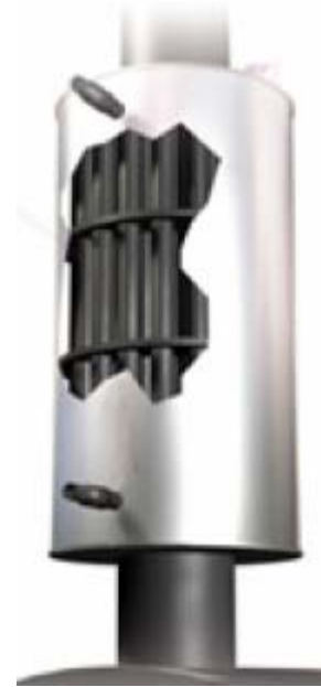
XID firetube type